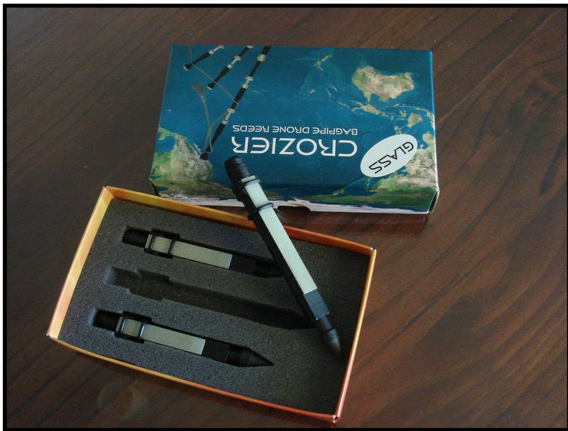
Crozier Glass Reeds

There is little that I can say that is negative about these reeds. We had no trouble setting them up in a variety of bagpipes, they tuned in the appropriate place with a little adjustment in each case and if set properly showed no sign of any significant fault. Quite easy for a novice player to set up and manage, just a little balancing experience would help with the end result. I would have no hesitation playing these in either solo or band settings. A product we would highly recommend.