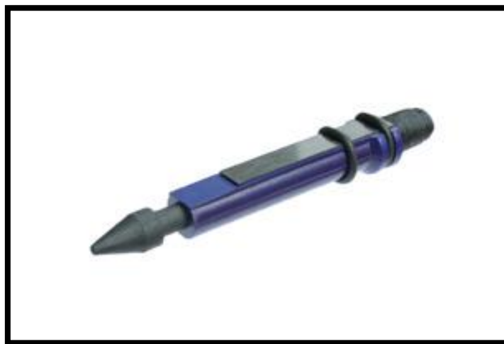
Crozier Carbon Reed

There is little that I can say that is negative about these reeds, they are highly recommended, bright in tone, strong on higher end harmonics, easy to set up and tune with a little knowledge of strength setting of reeds.