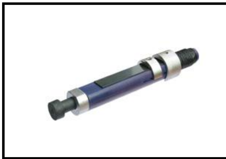
Omega Drone Reed

This reed offers the ultimate in adjustability, but can be a little confusing for a novice and is somewhat effected by temperature.