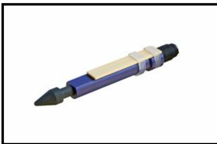
Crozier Cane Reed

Tonally I think this is one of the best synthetic reeds on the market. The blades however are cane so there can be some inconsistencies with blade strength and stability. Some spare blades and these are worth persisting with. They offer a little more tonal depth than the other options, and not as strong on the higher end harmonics. They also produce a very bright, vibrant drone sound.