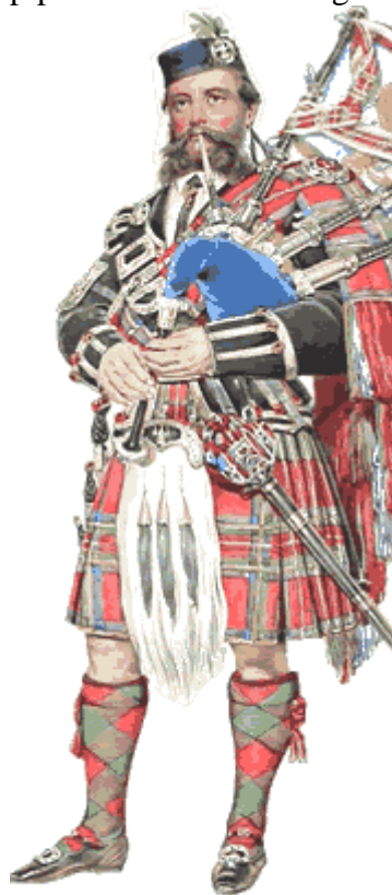
WILLIAM ROSS HER MAJESTY'S PIPER

Piobaireachd (pee-brock) is not the music of the pipe band, (a nineteenth century invention) nor is it the strathspeys and reels that folk dance to. These are known to pipers as Ceol Beag or little music. Piobaireachd (a Gaelic word literally meaning the playing of pipes) is called Ceol Mor , “the great music” of the pipe that serious pipers revere as the height of their art.