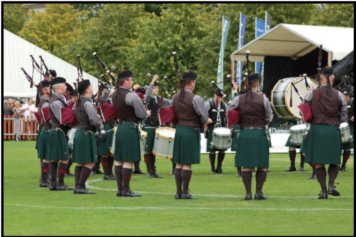
St Laurence O'Toole

A good medley will have some familiar music. A few of the top bands use familiar music to surround new material and give some breathing space. It breaks the predictability and nicely showcases the new material.