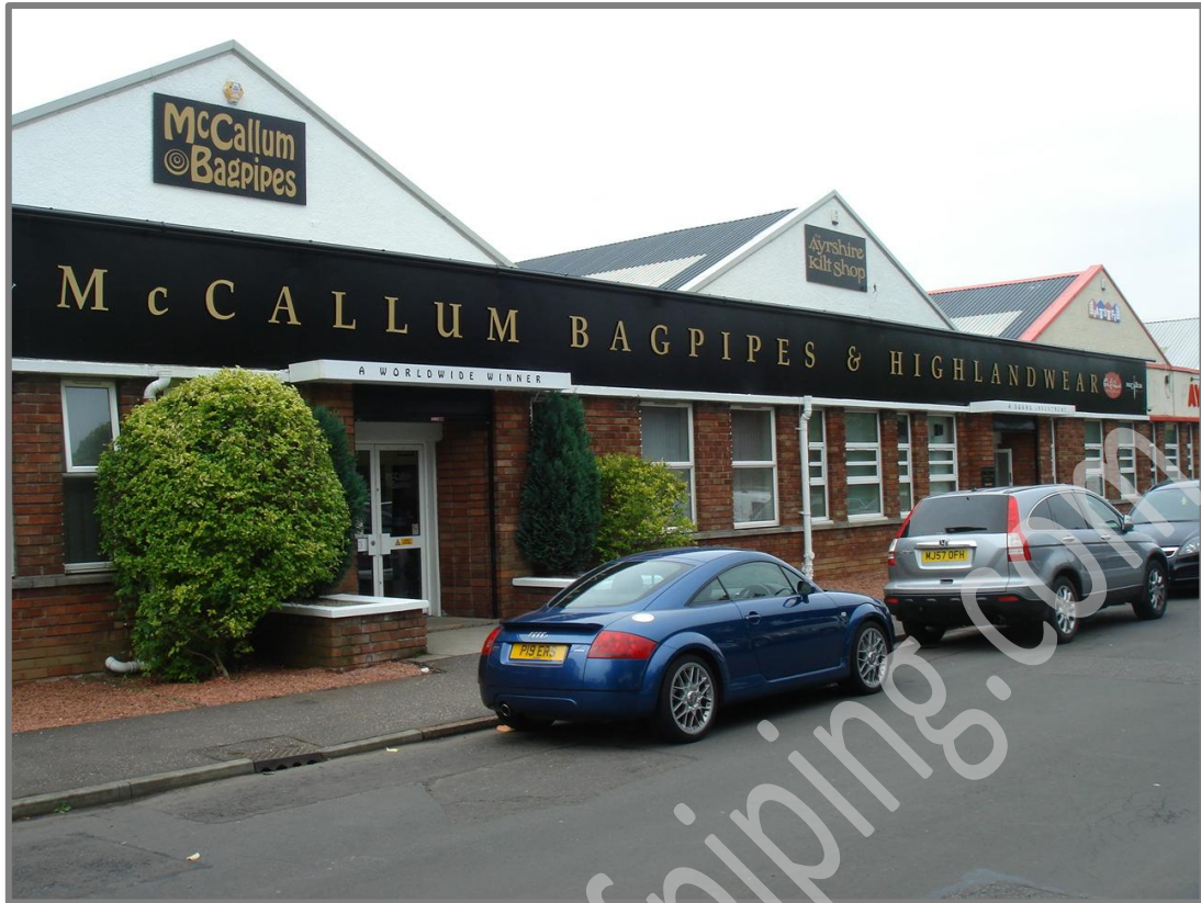
The entrance to the facility opens into a display area and shop, featuring Bagpipes, Reeds, Drums, Highland Wear and much more.