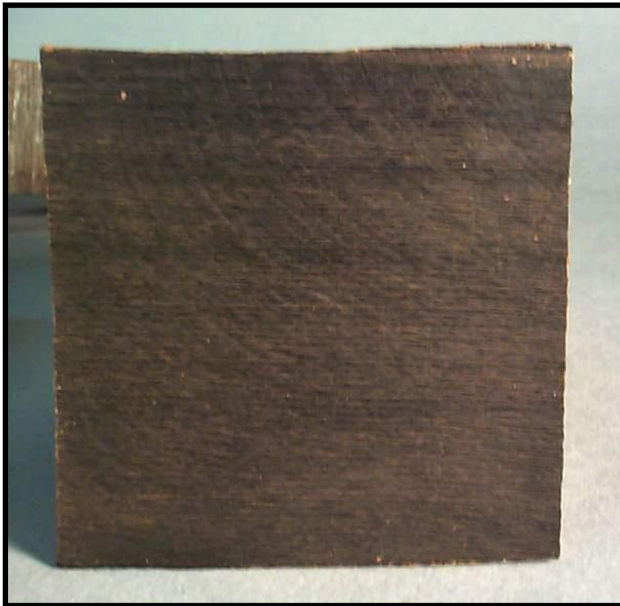
A billet of African Blackwood ready for turning