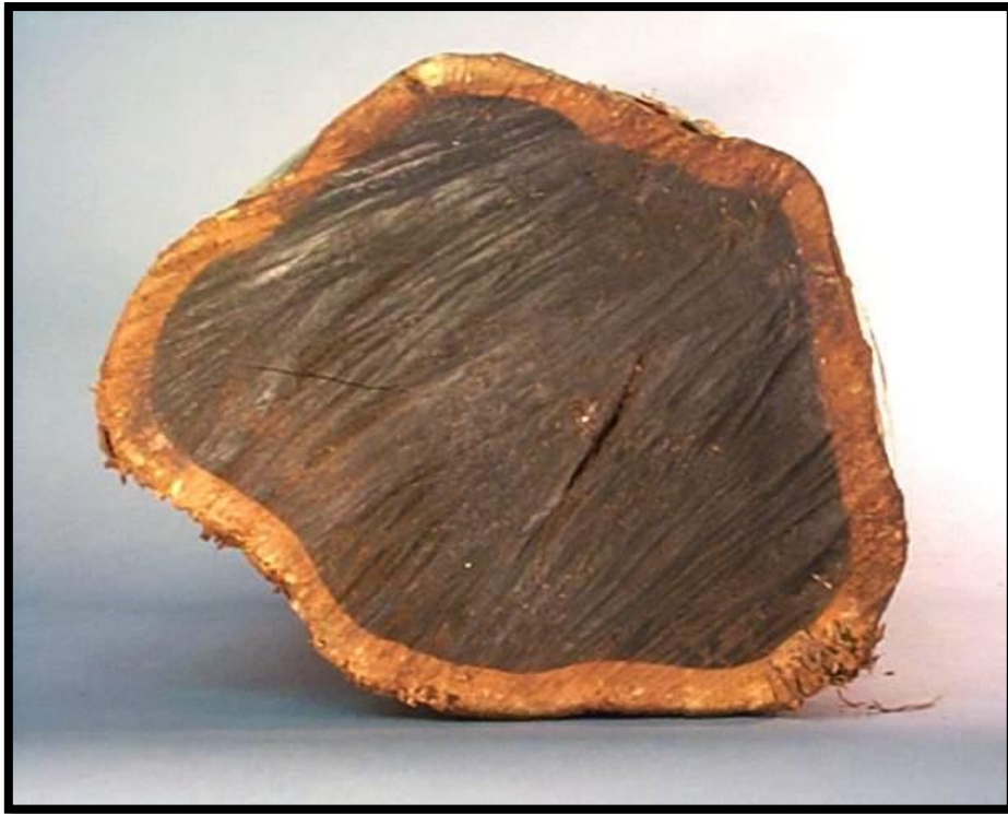
African blackwood end grain