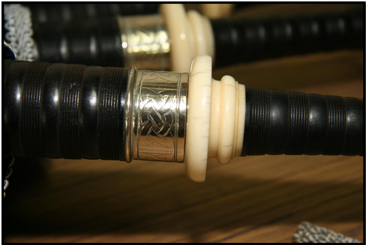
Silver ferrules on a set of 1902 Hendersons.

Many of the materials used as imitation ivory are quite brittle and do not support the wood. Ivory is more suitable however metal mounts if tightly affixed are preferable. They are thin and the wood of the stock or drone top is therefore thicker. Because they are so strong, if tight, they give adequate support to the wood.